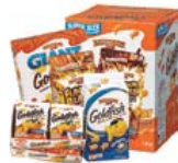
GOLDFISH® crackers 28 g, 168 g, 180 g, 190 g, 200 g, 1.36 kg SAVE: UPC