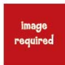
V8® V-FUSION® beverage 354 mL, 1.36 L SAVE: cap