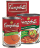
CAMPBELL'S® condensed soup 10 oz / 284 mL, 28 oz / 796 mL SAVE: full label (UPC and front panel)