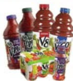
V8® vegetable cocktail 156 mL, 250 mL, 340 mL, 354 mL, 950 mL, 1.36 L, 1.89 L cans SAVE: crushed cans bottles SAVE: labels boxes SAVE: UPC