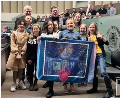
The full banner:

Last week the Barrie city council presented our grade five class with a banner for winning the 'I love Barrie' contest. You will see the collaboration of the grade five students' work on the banner in the picture below. Well done and we are super proud of our grade five class!!